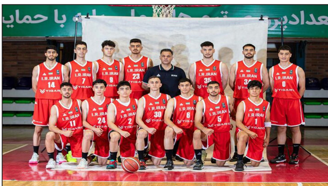
TEHRAN - Iran's U-18 boys' national basketball team on Tuesday kicked off their West Asia Championship campaign with a hard-fought victory over Palestine.

The young Iranian tall men secured a 97-87 win to secure their first points of the tournament.