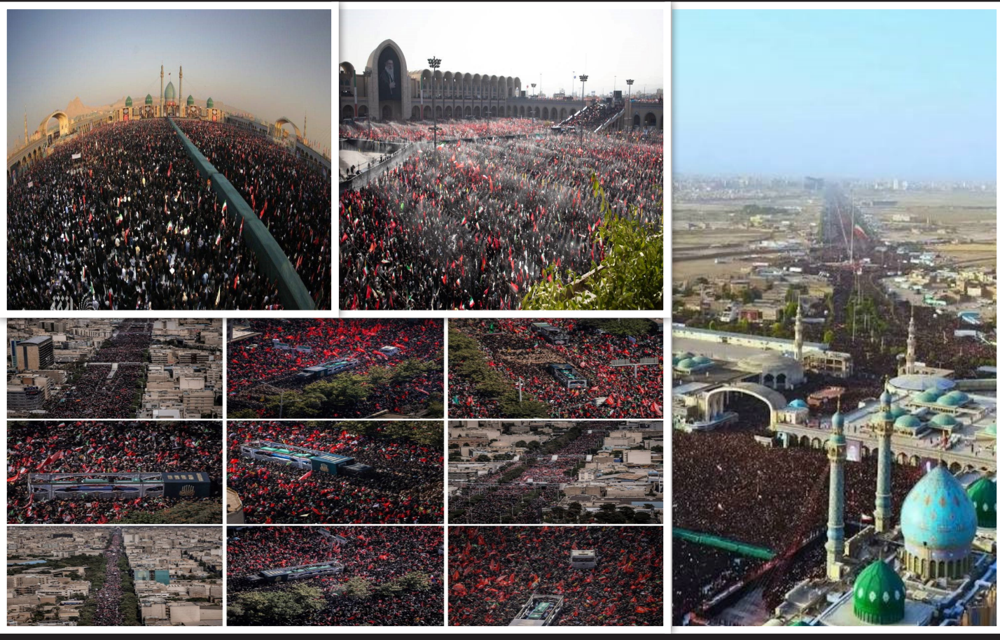
This combination of pictures shows mourning processions held in Tehran and Qom on Sunday, Monday and Tuesday.

But it was Monday's procession through the heart of Tehran and Tuesday's ceremonies in Qom that would come to define the historic nature of the farewell—a spectacle of collective grief compared to the legendary funeral of the revolution's