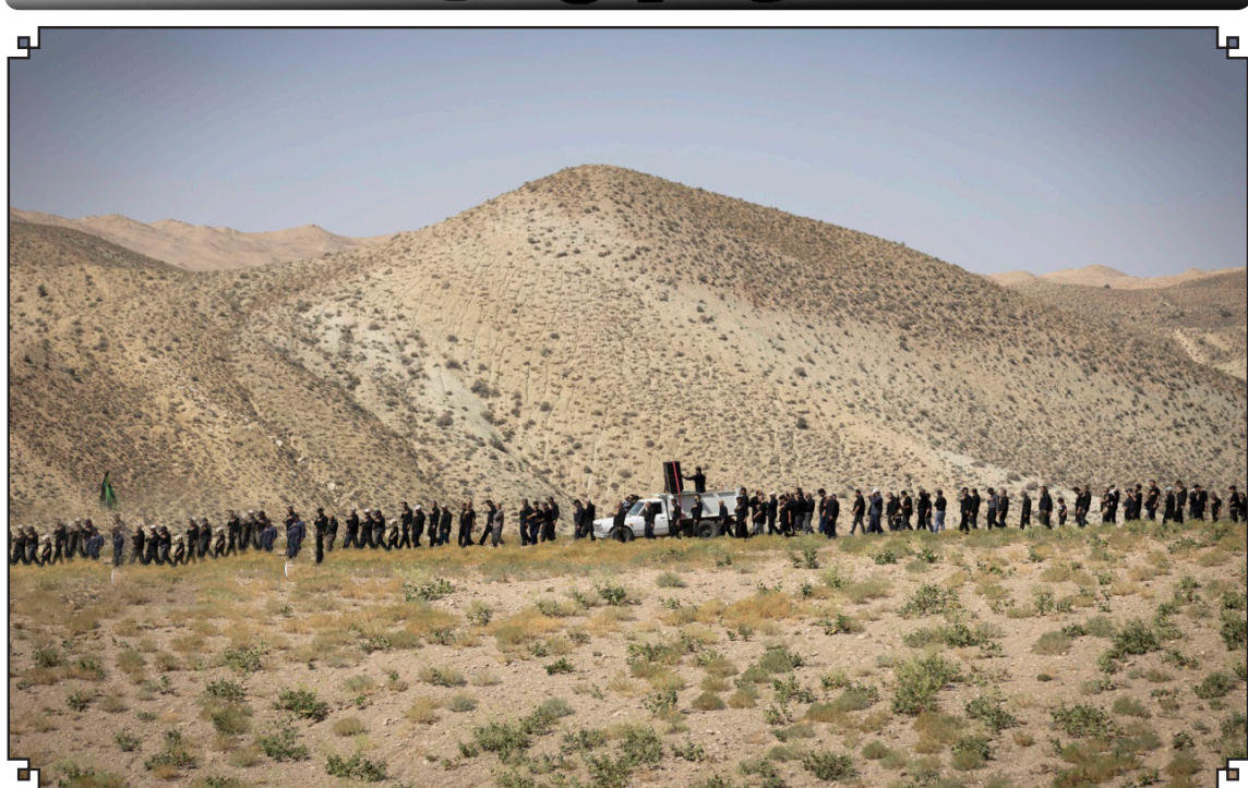
Mourners participate in the Ashura mourning procession in Arvaneh village, Semnan province, beginning with dawn prayers before marching to outside the village spring for traditional elegies.