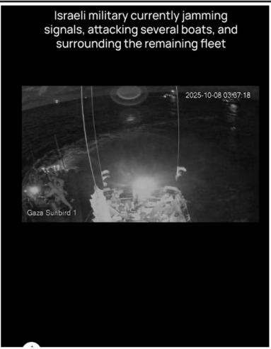
Israeli military currently jamming signals, attacking several boats, and surrounding the remaining fleet

Israeli forces attacked three ships of the Gaza-bound Freedom Flotilla Coalition (FFC) early Wednesday in international waters roughly 222 kilometers from the besieged Palestinian territory.