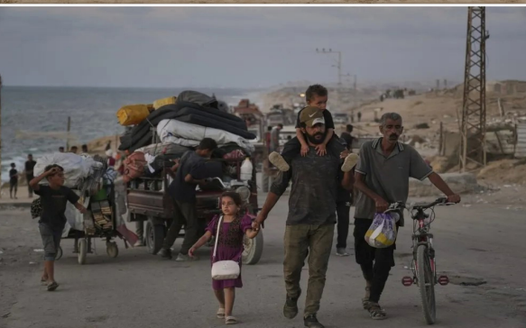
This combo shows patients in Al-Shifa hospital, which others leaving Gaza City on foot in the face of a barbaric onslaught by Israeli troops and tanks.

GAZA STRIP (Dispatches) -- Israeli troops and tanks pushed deeper into Gaza City on Wednesday as more people fled the devastated area, and strikes cut off phone and internet services, making it harder for Palestinians to summon ambulances during the Zionist military's new onslaught.