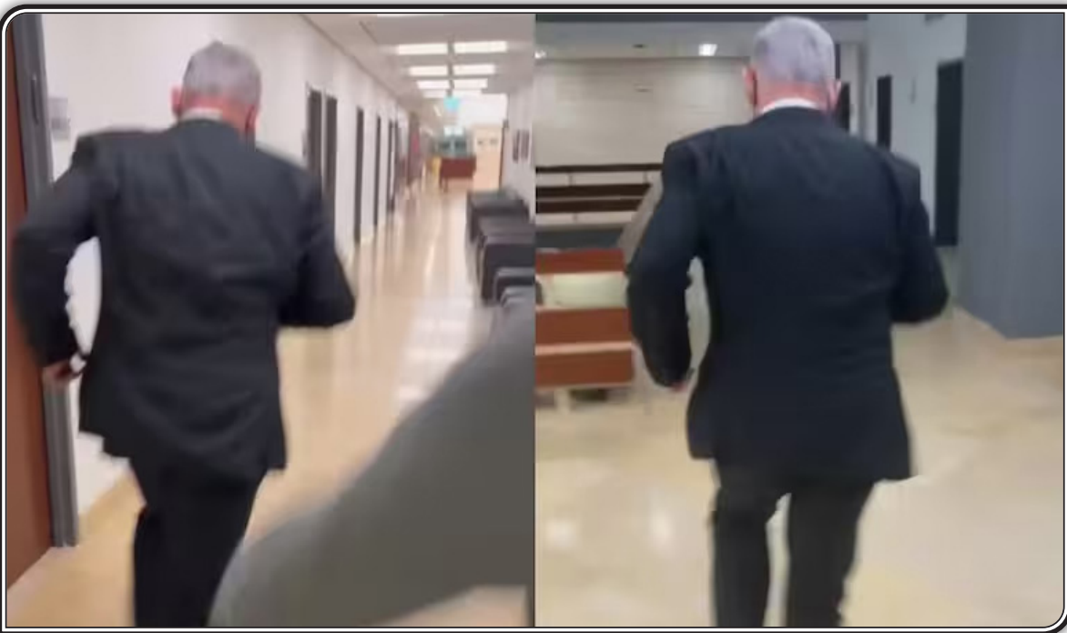
A video of Israel’s prime minister Benjamin Netanyahu running to a bunker to hide from an Iranian missile strike was shared on social media at the time.

TEL AVIV/GAZA CITY — Israeli prime minister Benjamin Netanyahu relocated a recent cabinet meeting to a fortified secret bunker in occupied Al-Quds, citing heightened security threats from Yemen’s Ansarullah movement, Israeli media reported.