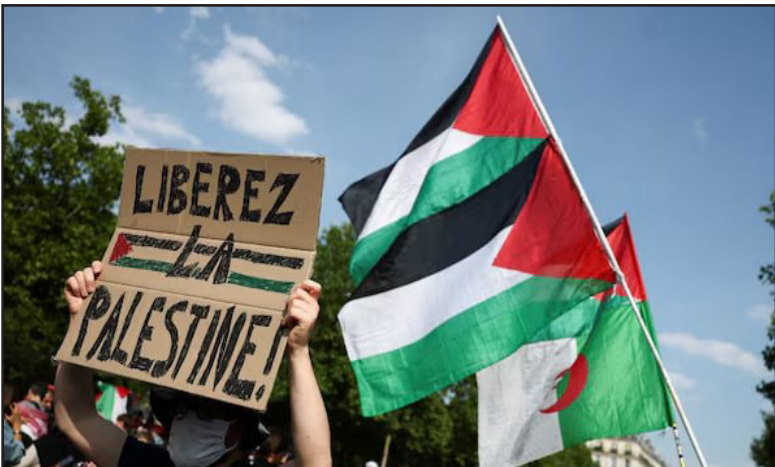
A man holds a placard reading “Free Palestine” during a demonstration, at the Place de la Republique in Paris, France, June 9, 2025.

PARIS (Dispatches) – French President Emmanuel Macron has announced that France will recognize a Palestinian state at the United Nations General Assembly in September, on a post on X on Thursday. “I have decided that France will recognize the State of Palestine,” he said. “I will make this solemn announcement at the United Nations General Assembly in September.”