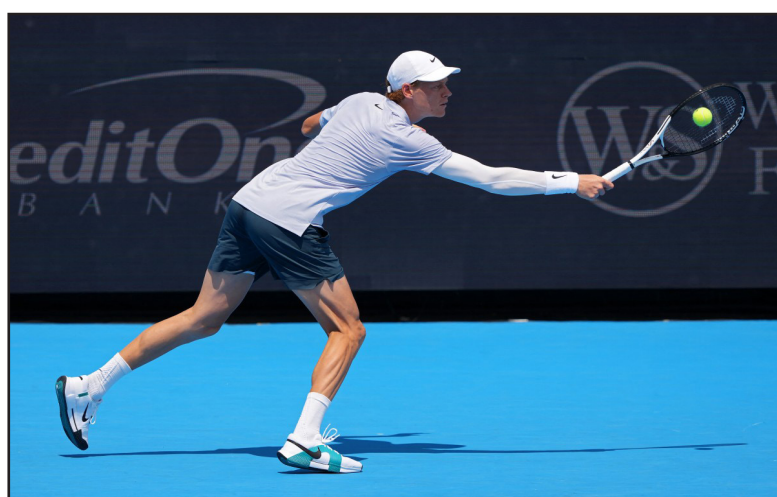
Jannik Sinner of Italy plays a backhand during the match against Adrian Mannarino of France during Day 7 of the Cincinnati Open.

Fellow Pole Magda Linette upset fourth seed Jessica Pegula 7-6(5)