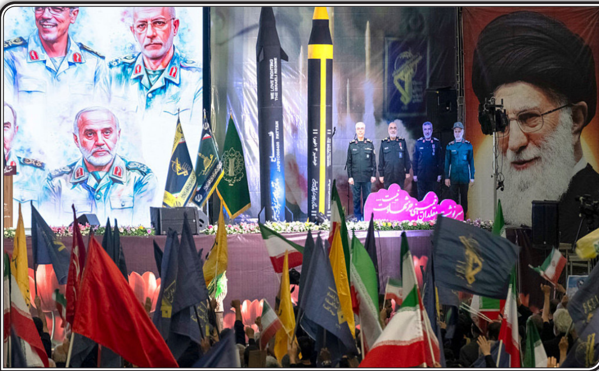
Iranians participate in a funeral procession for some of the senior military general martyred in the unprovoked Israeli aggression in Tehran.

TEHRAN -- A senior Iranian political official has said that Iran will not enter new negotiations with the U.S. under the previous framework or agenda, applying lessons learned from earlier talks, Press TV reported.