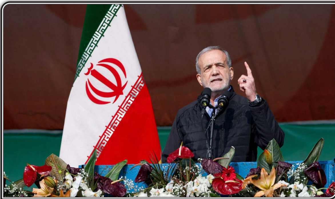
President Pezeshkian ordered all administrative organizations to implement a parliamentary directive to halt cooperation with the UN nuclear agency.

TEHRAN -- Iran on Wednesday formally suspended cooperation with the International Atomic Energy Agency for facilitating U.S. and Israeli attacks on its nuclear facilities.