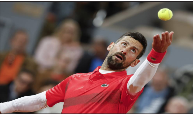
Novak Djokovic has contested every French Open since 2005 now he had "a proper coach". Asked about his last-minute decision to compete in Geneva, Djokovic said: "I think it was a good move, to be honest, because I was struggling a little bit with [my] confidence level, doubting my game a bit.

suffered first-round exits in both Monte Carlo and Madrid. But with his wait for a 100th Tour-level title finally over - one which had gone on since he completed the career 'Golden Slam' at the Paris Olympics last summer - the Serb will feel he is beginning to gain real momentum on this surface. The one-sided victory over McDonald, completed two minutes short of the two-hour mark, was his fifth successive win following a run of three straight losses. After that unfamiliar slump in results, Djokovic took the decision to end his six-month partnership with coach and former rival Andy Murray, who he said joked this week that he was winning tournaments