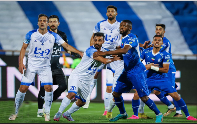
TEHRAN – The two finalists in the Iranian Hazfi Cup (knock-

out cup), Esteghlal and Malavan, will play at Aluminium