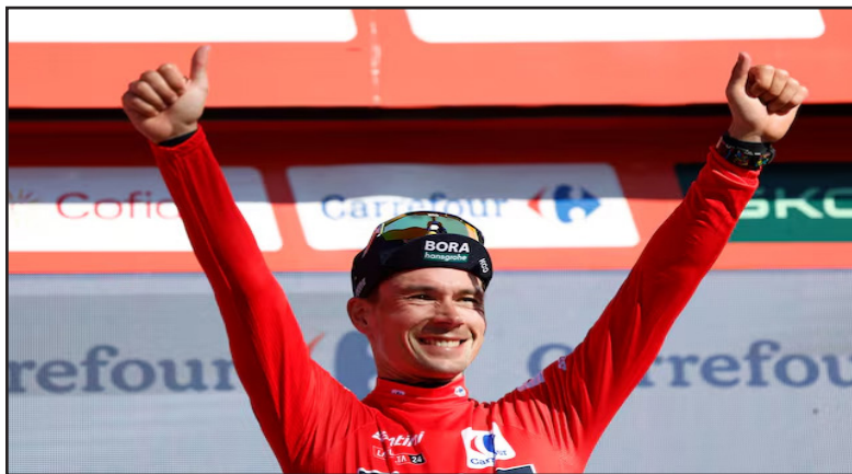
Hansgrohe's Primoz Roglic celebrates on the podium while wearing the red jersey after taking the overall race lead by winning stage 19.

"That's why we're heading to the start in Albania with a strong, well-balanced team. Primoz is in great shape, and the group around him is well-rehearsed and gives us tactical depth."