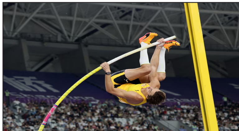
Sweden's Armand Duplantis in action during the men's pole vault final.

Jamaican Thompson was second in 9.99 with Botswana's Letsile Tebogo, who won