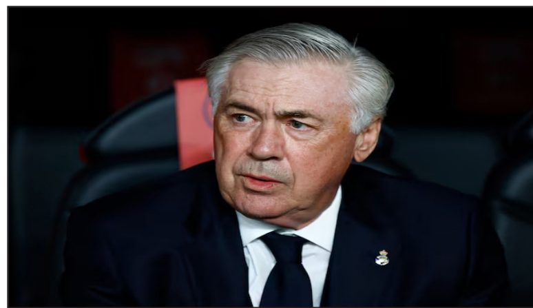
Real Madrid coach Carlo Ancelotti looks on before the match

MADRID (Reuters) - Real Madrid coach Carlo Ancelotti said he will speak about his future at the club only on the last day of the LaLiga season, as Spanish media reports continue to link him with a move to the Brazil national team.