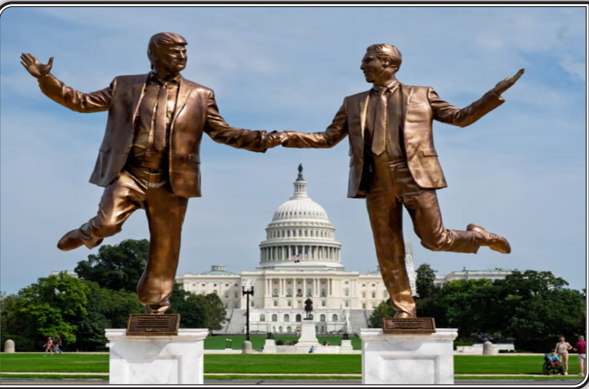
A statue featuring President Donald Trump and Jeffrey Epstein dancing, titled 'In Honor of Friendship Month,' appears on the east end of the National Mall in Washington on Sept. 23, 2025.

WASHINGTON (Dispatches) -- The latest release of the Jeffrey Epstein files by the U.S. Department of Justice on Tuesday, has once again thrust the disgraced financier's network into the national spotlight, igniting a storm of scrutiny, political maneuvering, and social media sleuthing.