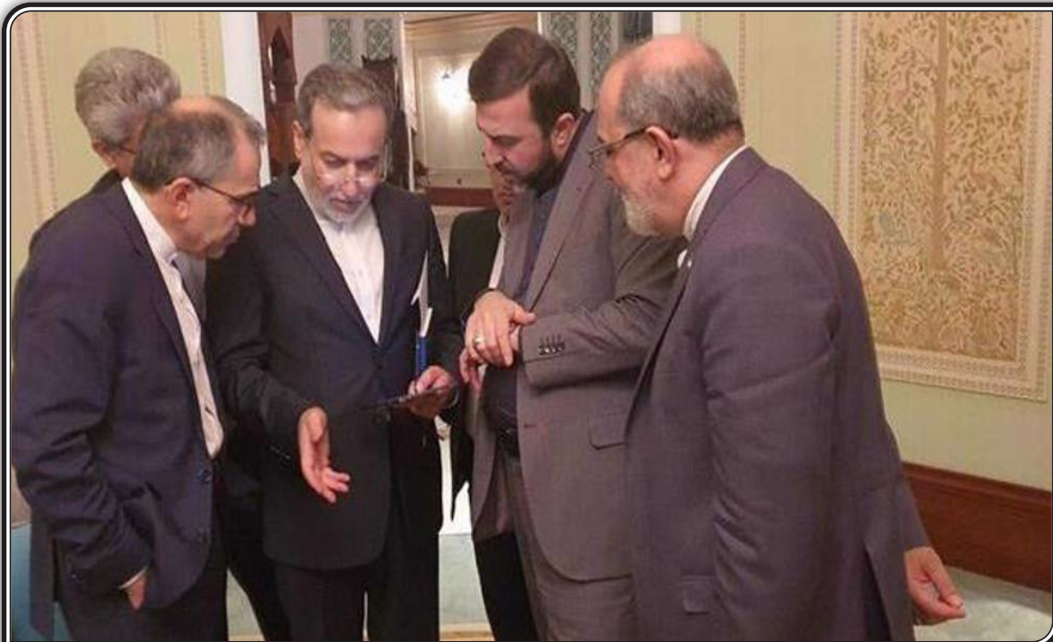
Iran's FM Abbas Araghchi, second left, with his delegation including deputy FM Kazem Gharibabadi, second right, after indirect talks with the U.S. in Muscat, Oman, on April 12, 2025.

TEHRAN -- Deputy Foreign Minister for Legal and International Affairs Kazem Gharibabadi said Sunday Tehran has firmly dismissed negotiating over its fundamental right to enrich uranium, declaring it a "red line."