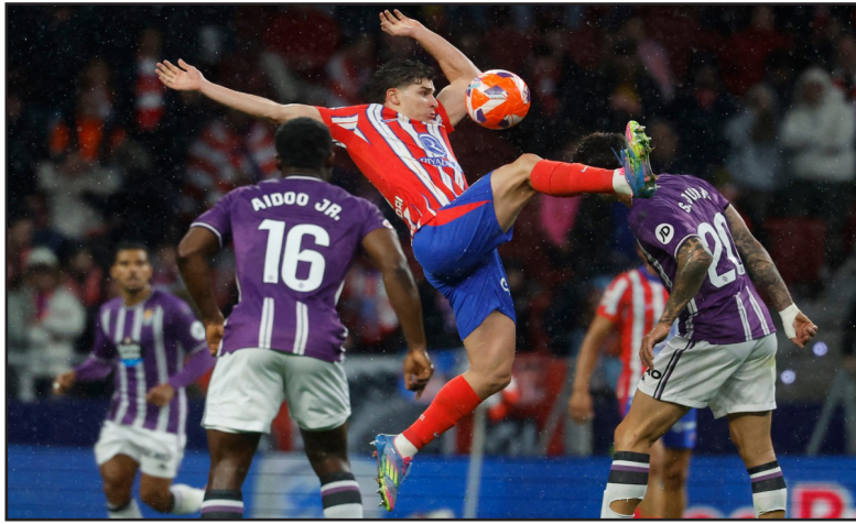
Atletico Madrid's Argentine forward #19 Julian Alvarez (center) jumps for the ball.

Valladolid grabbed a surprise lead after 21 minutes when Mamadou Sylla calmly convert-