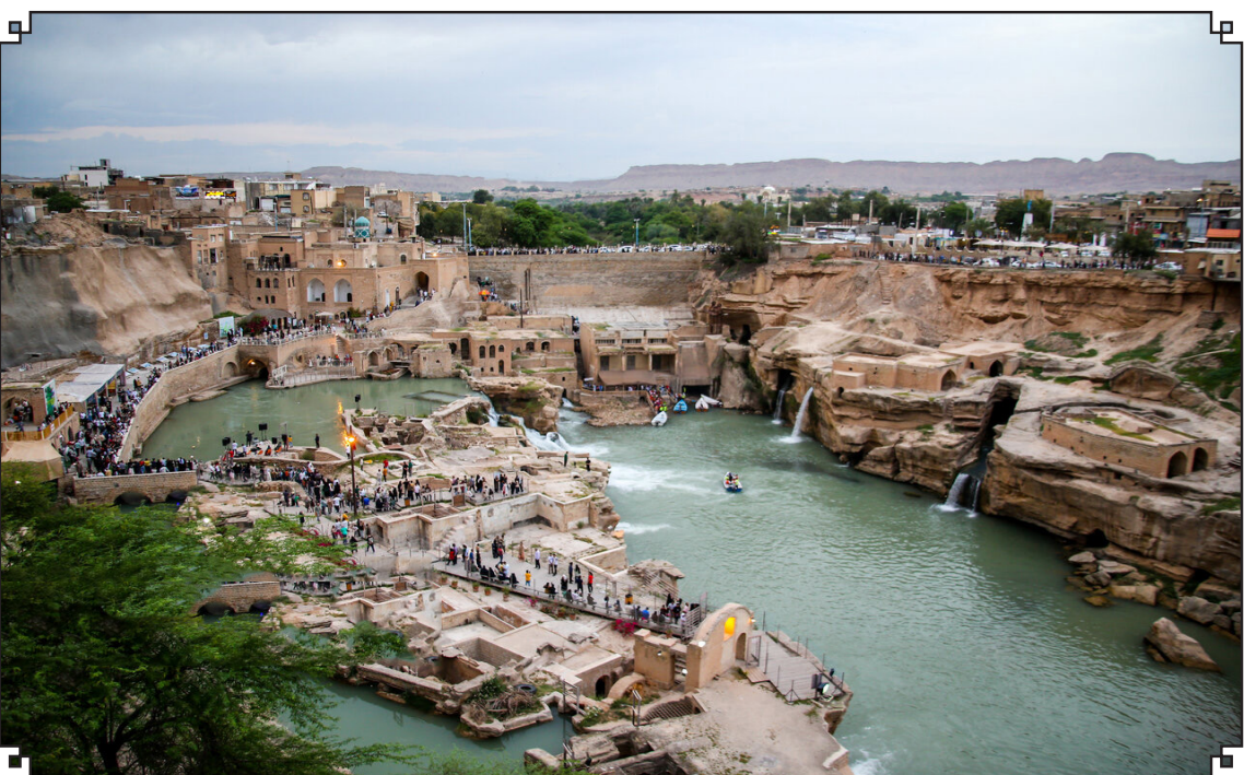
The Shushtar Historical Hydraulic System is a complex irrigation system from the Sasanian era, recognized by UNESCO as a masterpiece of human ingenuity and creativity.