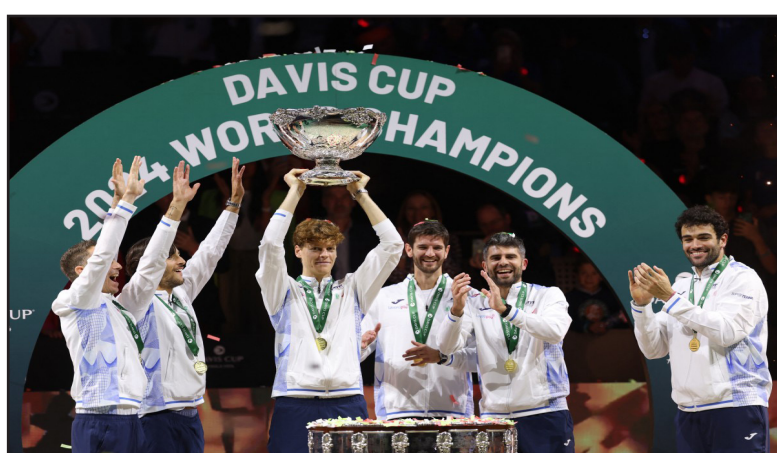
Italy's Jannik Sinner raises the trophy with teammates after winning the Davis Cup Finals at the Palacio de Deportes Jose Maria Martin Carpena arena in Malaga, southern Spain, on Nov 24, 2024.

MALAGA (Reuters) - Italian Jannik Sinner completed a remarkable season by sealing his country a second successive Davis Cup title in the final at the southern Spanish city of Malaga on Sunday.