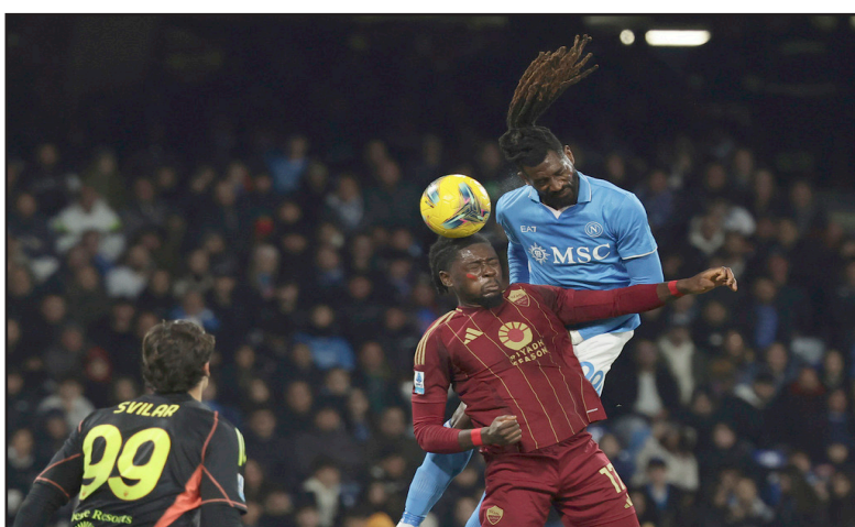
Napoli's Andre-Frank Zambo Anguissa (top) and Roma's Manu Kone vie for the ball during the Italian Serie A soccer match between Napoli and Roma at the Diego Armando Maradona Stadium in Naples, Italy, Nov 24, 2024.

day for Roma manager Claudio Ranieri, who began his third stint in charge at the club, with his side 12th in the table with 13