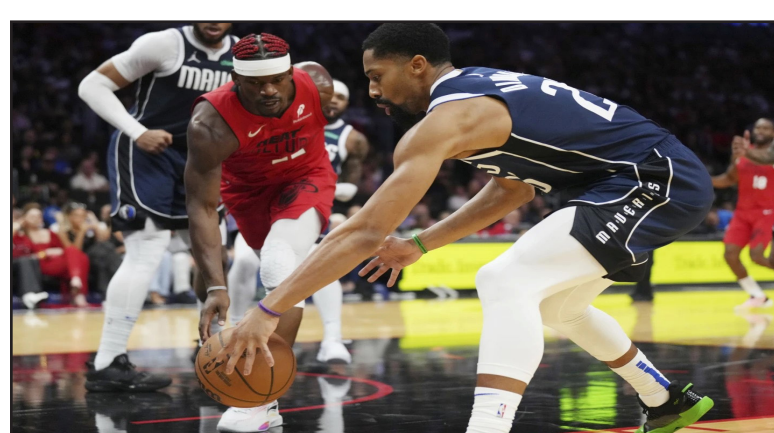
Miami Heat forward Jimmy Butler (22) battles with Dallas Mavericks forward P.J. Washington (25) for a loose ball during the second half of an NBA basketball game, Sunday, Nov. 24, 2024, in Miami.

The Mavericks played without Luka Doncic, still sidelined with a sprained right wrist. The Heat were without Terry Rozier, who was expected to play but wound up being scratched with a recurrence of right foot discomfort.