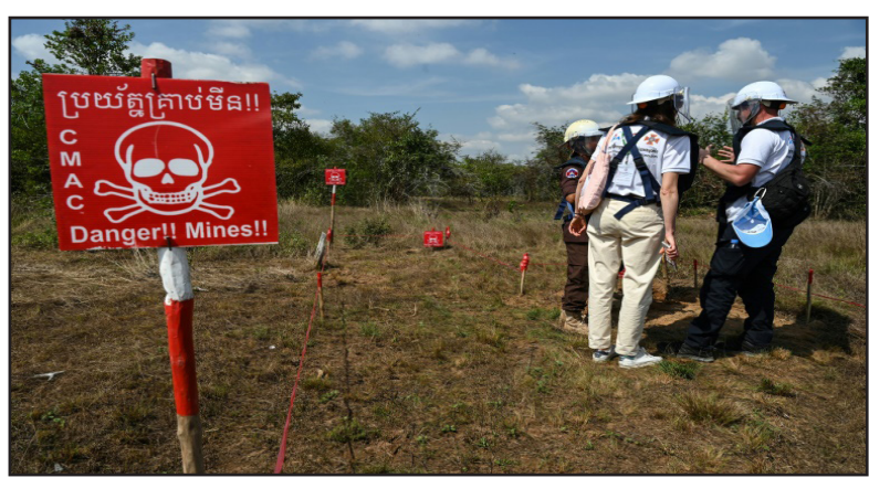
Cambodia was left one of the most heavily bombed and mined countries in the world after three decades of civil war.

SIEM REAP, Cambodia (AFP) -- The UN Secretary-General on Monday slammed the "renewed threat" of anti-personnel landmines, days after the United States said it would supply the weapons to Ukrainian forces battling Russia's invasion.