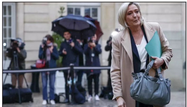
Le Pen is putting Barnier's government in an increasingly precarious position.

PARIS (AFP) -- French far-right figurehead Marine Le Pen on Monday threatened to back a no confidence motion that could topple the government of Prime Minister Michel Barnier in a standoff over the budget, saying after talks both sides were entrenched in their positions.