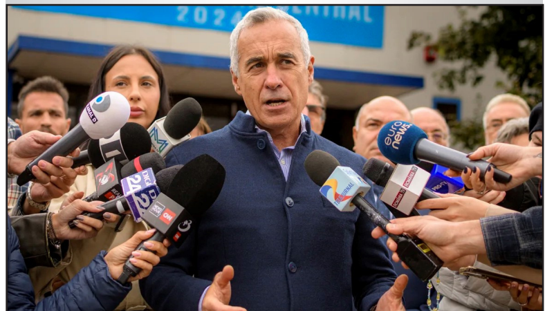
Calin Georgescu, who ran as an independent candidate for president, is pictured in Bucharest, Romania, Oct. 1, 2024.

BUCHAREST (AFP) -- Far-right candidate Calin Georgescu surged unexpectedly in Romania's presidential election, pulling ahead of the pro-European prime minister with more than 98 percent of votes counted Monday and looking all but certain to advance to a runoff.