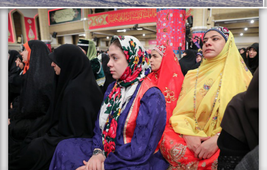
Ayatollah Khamenei meets a group of women on the eve of the birth anniversary of Sayyida Fatimah al-Zahra (SA) in Tehran on Tuesday.

TEHRAN -- Leader of the Islamic Revolution Ayatollah Seyyed Ali Khamenei said Tuesday that the Zionist regime of Israel and the U.S. are "completely wrong" to imagine the Axis of Resistance had collapsed with the ouster of President Bashar al-Assad and other developments. "With the developments in Syria