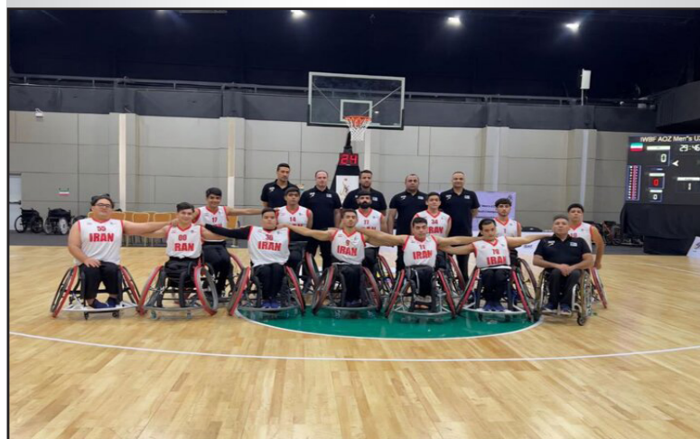
TEHRAN – Iran defeated Saudi Arabia 76-24 at the 2024 International Wheelchair Basketball Federation (IWBF) U-23 Asia Oceania Championship.

Iran started the competition on Monday, defeating the Philippines 80-28 but lost to Australia 71-48 later in the day.