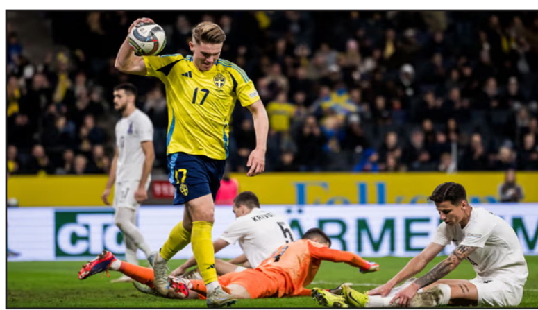
Sweden's Viktor Gyokeres after his fourth goal in Tuesday evening's 6-0 win against Azerbaijan.

English Championship with Swansea City and Coventry City before moving to Portugal, has scored 23 club goals for Sporting this season and nine goals for Sweden in 2024-25.