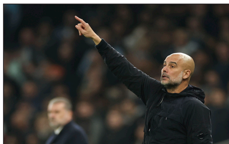
Manchester City's head coach Pep Guardiola

The 53-year-old, who joined the club in 2016, has led City to six league titles, two FA Cups and a Champions League triumph as part of their treble win in 2023, along with a FIFA Club World Cup and four League Cups.