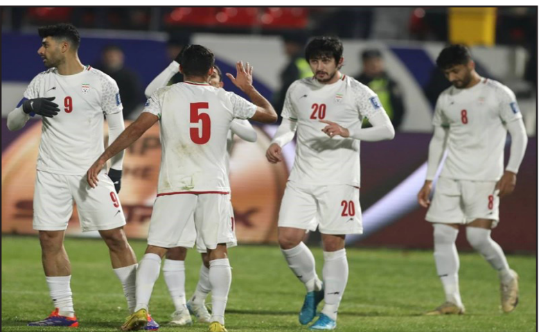
TEHRAN – Iran had to dig deep to overcome Kyrgyzstan 3-2 in the AFC Asian Qualifiers – Road to 26 Group A clash on Tuesday to move

closer to a place in the FIFA World Cup 26 Finals.