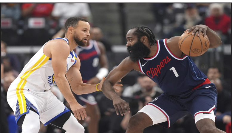
Los Angeles Clippers guard James Harden, right, tries to get past Golden State Warriors guard Stephen Curry during the second half of an NBA basketball game, Monday, Nov. 18, 2024, in Inglewood, Calif.

INGLEWOOD, Calif. (AP) — Norman Powell scored 23 points and the Los Angeles Clippers held off the Golden State Warriors 102-99 on Monday night to win their fifth in a row at home.