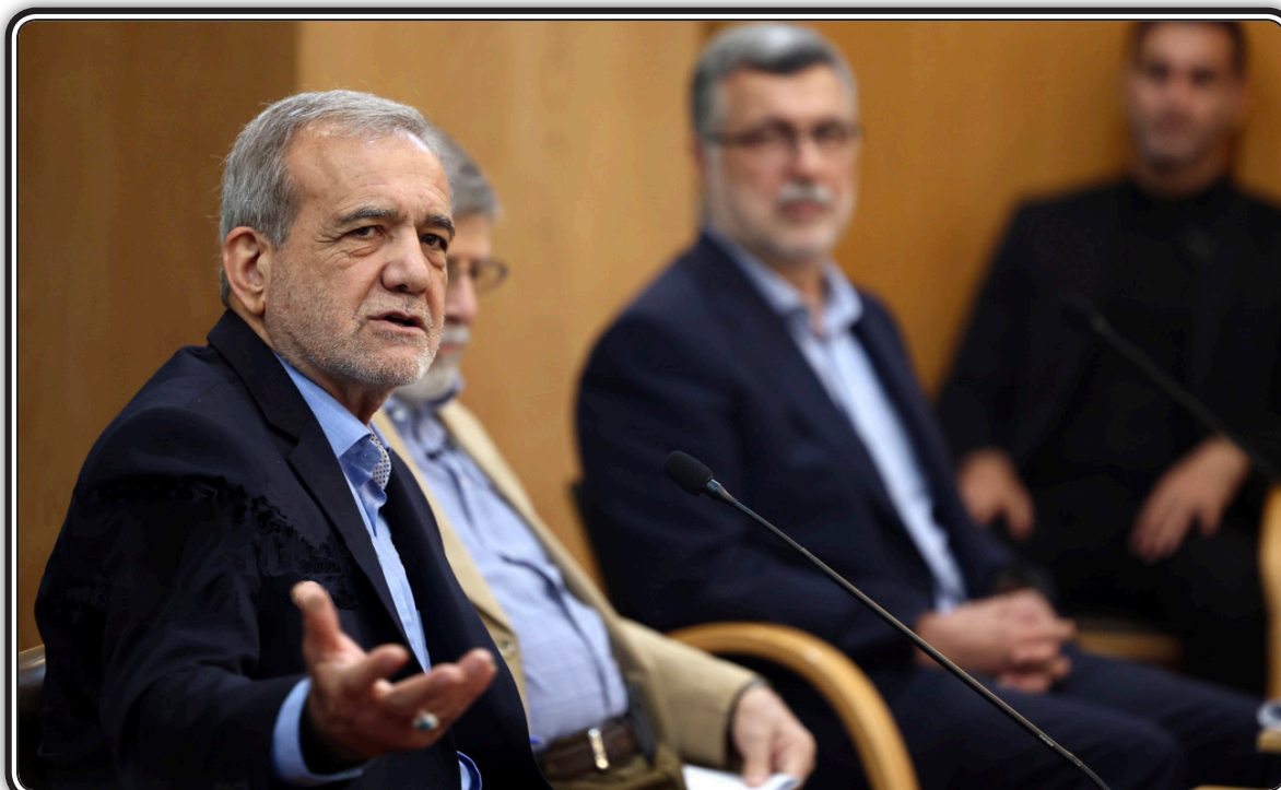
President Masoud Pezeshkian addresses the General Assembly of the Academy of Medical Sciences in Tehran on Aug. 29, 2024.

TEHRAN -- President Masoud Pezeshkian says Iran condemns any aggression in the world, stressing that the Islamic Republic's principled policy is to foster peace and friendship, prevent tensions and interact with world countries.