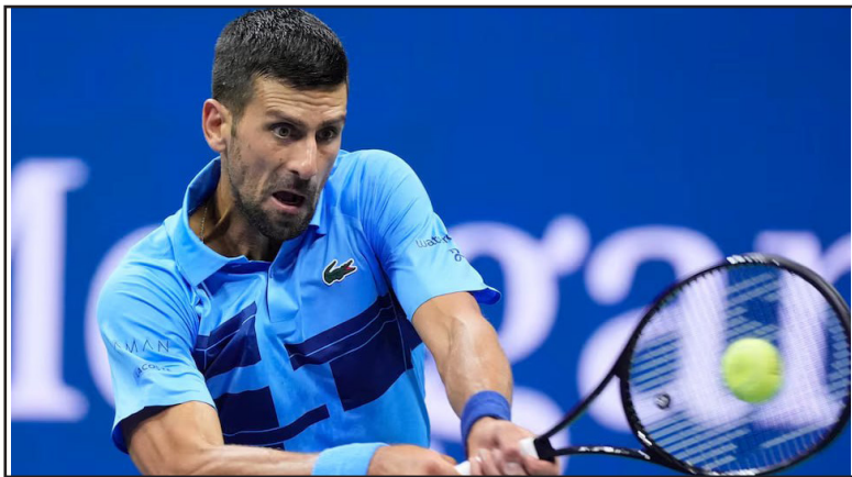
Novak Djokovic of Serbia in action against Alexei Popyrin of Australia in a third round match.

The result will also mark the first time since 2002 that a year will finish without a member of the "Big Three"