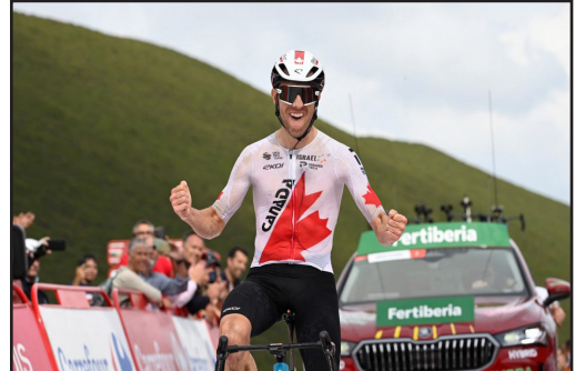
PARIS (Reuters) - Canadian cyclist Michael Woods clinched victory on the 13th stage of the

Vuelta a Espana on Friday with a decisive late breakaway in the difficult mountains of north-western Spain.