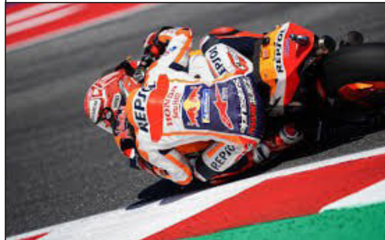
Marc Marquez celebrates his return to the top of the MotoGP podium.

ALCAÑIZ, Spain (AFP) - Marc Marquez dominated the Aragon sprint race on Saturday to end three years in the MotoGP wilderness.