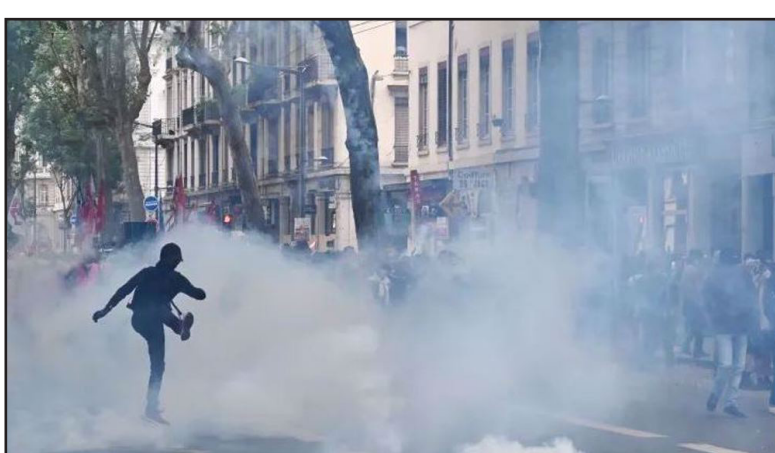
A protester kicks back a tear gas canister fired by police during a demonstration against fascism and the National Rally party, in Lyon, France, June 16, 2024.

PARIS (AFP) – Human rights groups in France are sounding the alarm about the “liberation of racist hatred” in the country, which they attribute to gains made by the far right in recent elections. The National Rally (RN) of Marine Le Pen and Jordan Bardella emerged as the clear winner of the 9 June European elections in France, obtaining 31.37 percent of the votes. The party is also expected to lead in the snap legislative elections called by President Emmanuel Macron following his defeat.