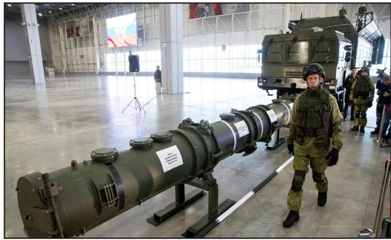
A Russian military officer walks past the 9M729 land-based cruise missile on display in Kubinka outside Moscow, Russia, on Jan. 23, 2019.

MOSCOW (Dispatches) – Russia must respond to the actions of the United States and it seems that it is necessary for the country to start the production of intermediate-range nuclear forces (INF) strike systems, Russian President Vladimir Putin says. “We need to respond to this and make decisions about what we will have to do in this direction next. Apparently, we need to start manufacturing these systems and then, based on the actual situation, make decisions about where – if necessary to ensure our safety – to deploy them,” Putin said at an operational meeting with the permanent members of the Russian Security Council, Sputnik reported.