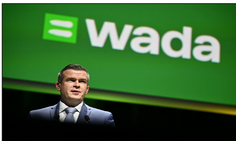
World Anti-Doping Agency (WADA) President Witold Banka

The world anti-doping chief quoted in the statement American politician Adlai E. Stevenson's saying "A hypocrite is the kind of politician who would cut down a redwood tree, then mount the stump and make a speech for conservation" when addressing the talks in the hearing, led by Travis Tygart of the U.S. Anti-Doping Agency (USADA), who claimed other countries and WADA were not playing by the rules when numbers showed themselves are