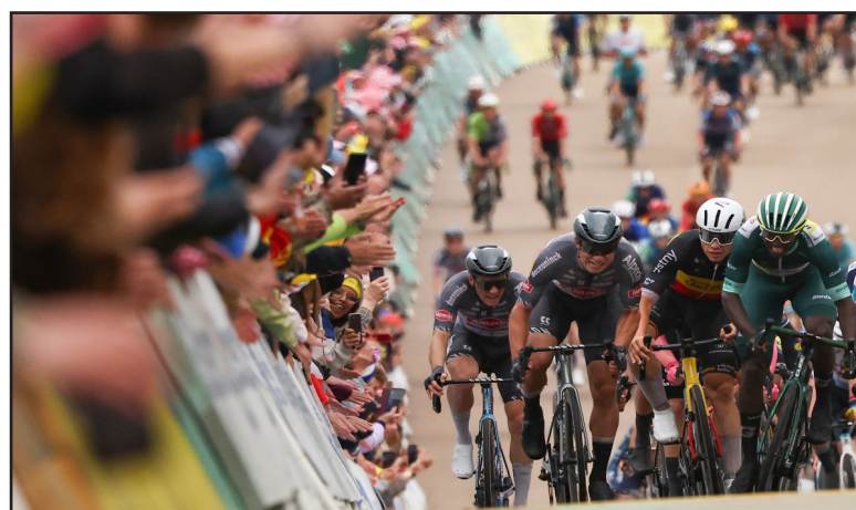
Wanted team's Eritrean rider Biniam Girmay (right) wearing the sprinter's green jersey sprints the finish line to win ahead of second-placed Alpecin-Deceuninck team's Belgian rider Jasper Philipsen (second left).

It was a big relief for the 26 year-old, whose best result was a second place since the start in Florence.