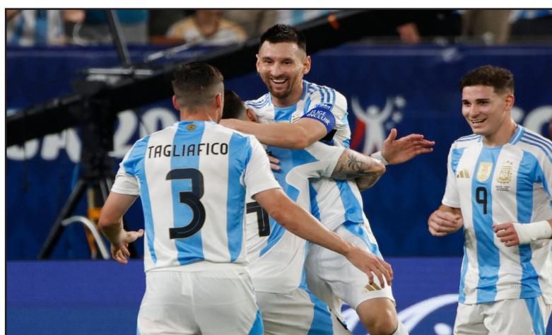
Argentina's forward #10 Lionel Messi celebrates with teammates.

EAST RUTHERFORD (AFP) - Defending champions Argentina booked their place in the Copa