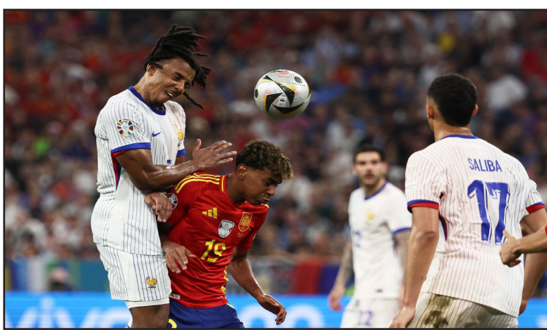
France's defender #05 Jules Kounde (up) fights for the ball with Spain's forward #19 Lamine Yamal during the UEFA Euro 2024 semifinal football match between Spain and France at the Munich Football Arena in Munich on July 9, 2024.

The Spaniards, who have won every game of the tournament so far, confirmed their fa-