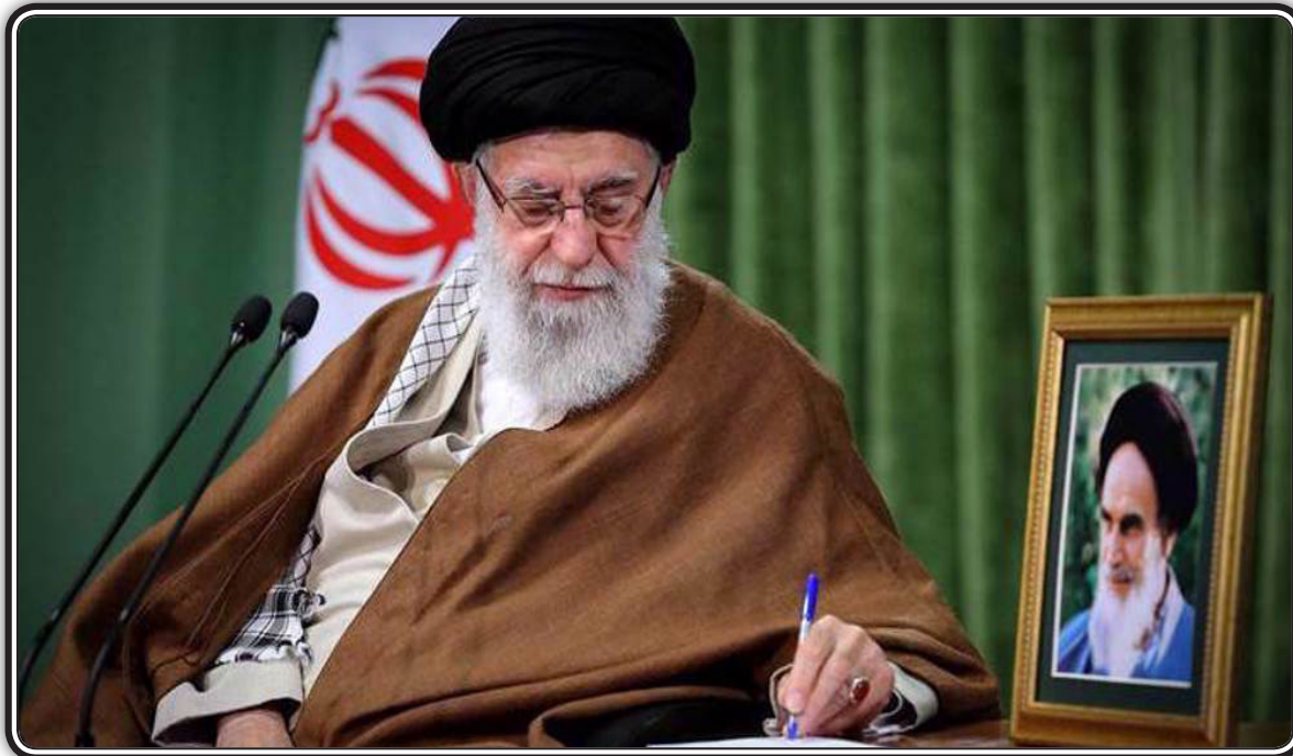
Ayatollah Khamenei regularly issues pardon on special occasions such as religious festivities.

TEHRAN -- Leader of the Islamic Revolution Ayatollah Seyyed Ali Khamenei has pardoned or commuted the sentences of 2,654 inmates on the occasion of Eid al-Adha and Eid al-Ghadir celebrations.