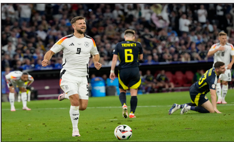
Germany's Niclas Fuellkrug celebrates after scoring his side's fourth goal during a Group A match between Germany and Scotland at the Euro 2024 soccer tournament in Munich, Germany, June 14, 2024.

That ambitious strategy proved fatal for the visitors, who left far too many