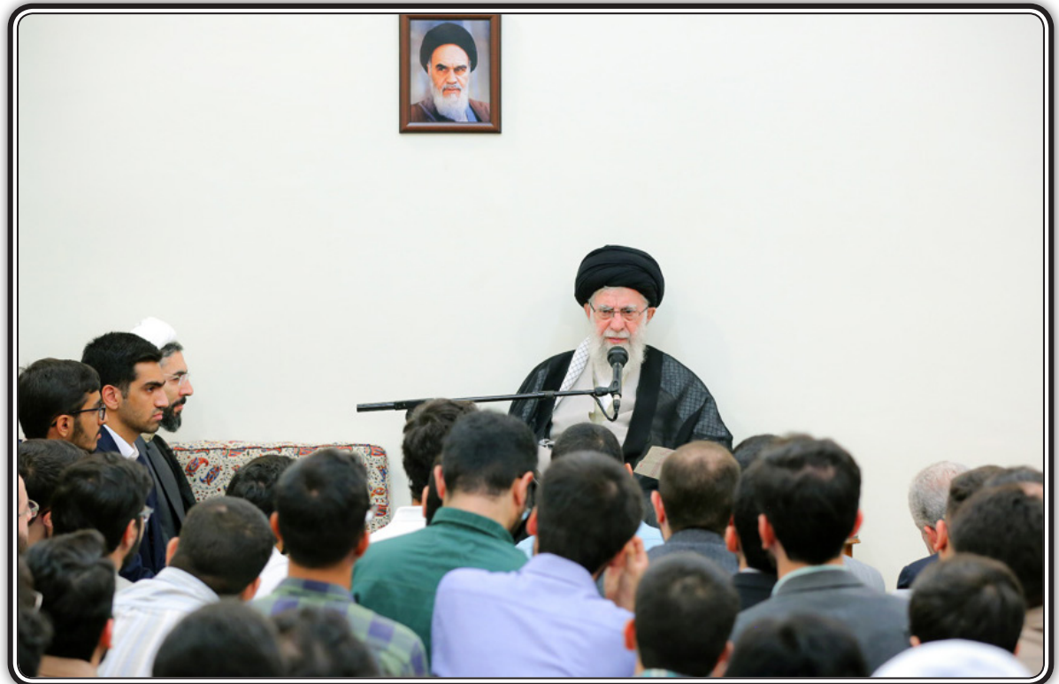
Ayatollah Khamenei speaks in a meeting with a number of Iranian medalists of national and international scientific Olympiads in Tehran on June 15, 2024.