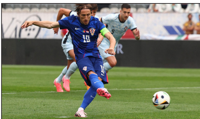
Croatia's Luka Modric (left) challenges for the ball with Portugal's Bruno Fernandes during an international friendly soccer match between Portugal and Croatia at the National Stadium in Oeiras, outside Lisbon, June 8, 2024.

Diogo Jota brought Portugal level three minutes after coming on, when fellow substitute