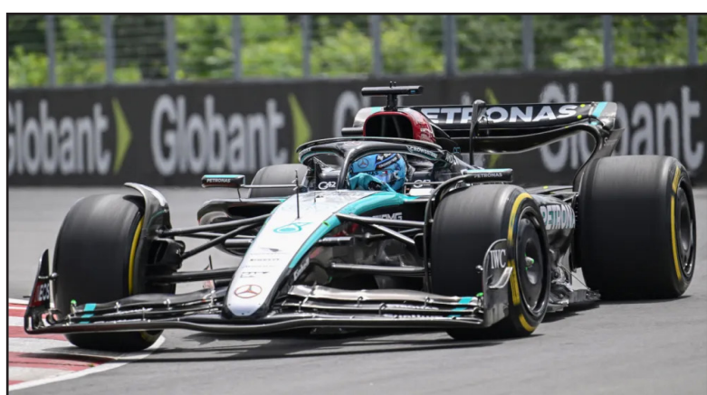
Mercedes driver George Russell of Britain celebrates after winning the pole position for the Sunday race in the qualifying session for the Formula 1 Canadian Grand Prix auto race, June 8, 2024, in Montreal.

MONTREAL (Reuters) - Verstappen. George Russell put Mercedes on pole position for the Canadian Grand Prix by the blink of an eye on Saturday after setting exactly the same time as Red Bull's Max