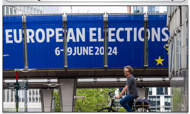
Tens of millions of voters from Vilnius to Madrid cast ballots Sunday on the final day of elections for the EU's parliament.

BRUSSELS (AFP) - Tens of millions of voters from Vilnius to Madrid were casting ballots Sunday on the final day of elections for the EU's parliament, with far-right parties eyeing gains at a pivotal time for the