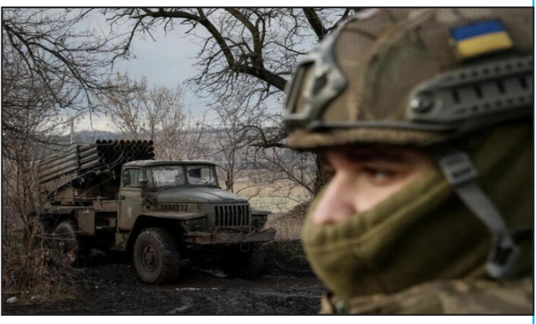
Two civilians were killed in Ukrainian attacks on Russian-administered areas of eastern and southern Ukraine.

arsenal of missiles available to Moscow, has focused on making longrange drones to strike targets deep inside Russia.