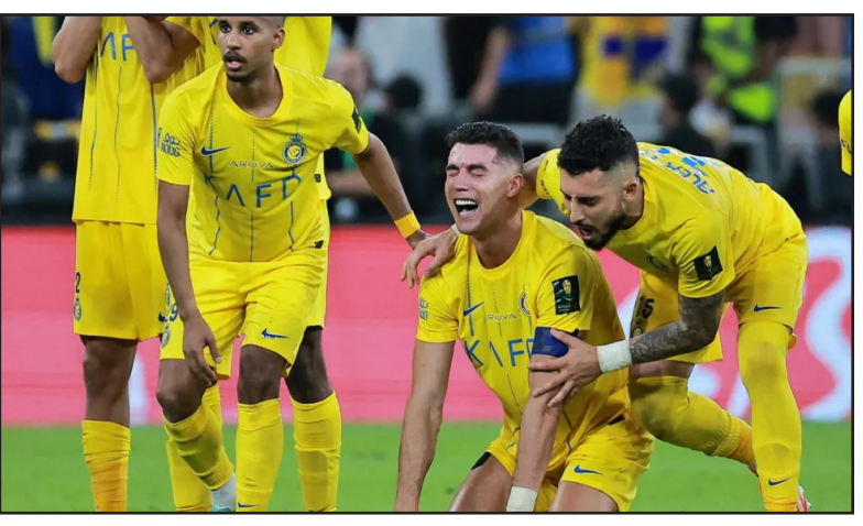
Cristiano Ronaldo joined Al-Nassr in December 2022