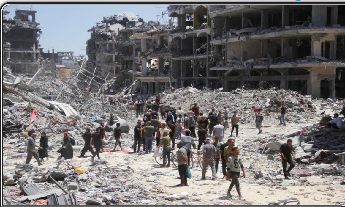
Palestinians inspect the damage after Zionist forces withdrew from Jabalia refugee camp, following an invasion, in the northern Gaza Strip, May 31, 2024.

RAFAH (Dispatches) - Zionist forces on Saturday pounded Rafah in southern Gaza with tanks and artillery just after U.S. President Joe Biden said the Israeli regime was offering a new roadmap towards a full ceasefire.