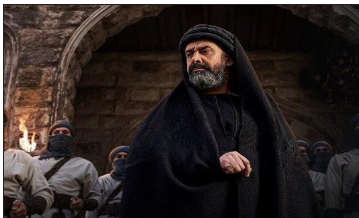
Hassan-i Sabbah in a screengrab from a scene of Egyptian show El-Hashashin.