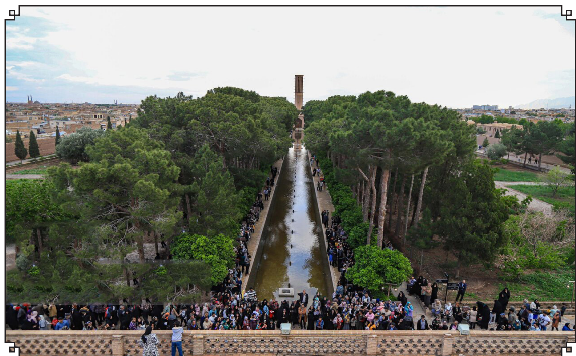
The tradition of rose water distillation at Dowlatabad Garden of Yazd for use in the holy shrine of Imam Reza (AS) and other holy shrines has been revived in a ceremony held for the first time in two decades.