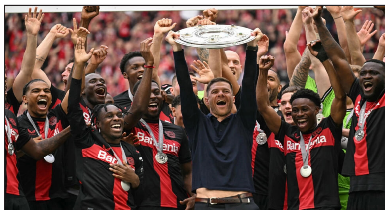
Champions: Bayer Leverkusen coach Xabi Alonso and his players celebrate with the Bundesliga trophy.

LEVERKUSEN (AFP) – Bayer Leverkusen on Saturday became the first team in Bundesliga history to go through an entire season unbeaten after a 2-1 home win against Augsburg extended their undefeated streak in all competitions to 51 games.