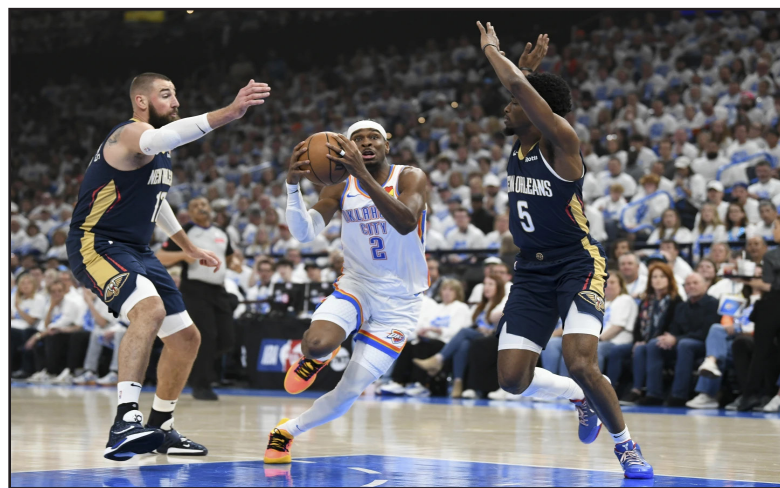
Oklahoma City Thunder guard Shai Gilgeous-Alexander (2) drives past New Orleans Pelicans center Jonas Valanciunas, left, and forward Herbert Jones (5) in the first half of Game 1 of an NBA basketball first-round playoff series, Sunday, April 21, 2024, in Oklahoma City.

OKLAHOMA CITY (AP) — Gilgeous-Alexander scored 28 points, including the go-ahead basket in the final minute, and the top-seeded Thunder edged the New Orleans Pelicans 94-92 in Game 1 of their first-round Western Conference playoff series Sunday night.