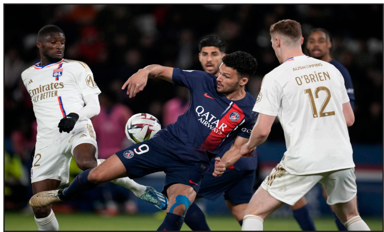
Lyon's Jake O'Brien (right) challenges PSG's Goncalo Ramos during the French League One soccer match between Paris Saint-Germain and Lyon at the Parc des Princes stadium in Paris on April 21, 2024.

PARIS, France (Reuters) - Paris St Germain continued their march towards the Ligue 1 title with a 4-1 win at home against Olympique Lyonnais on Sunday with all the goals coming in an explosive first half.