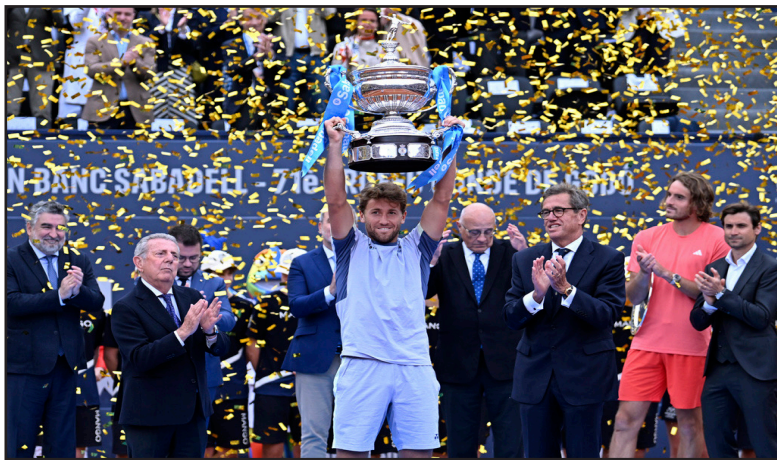
Casper Ruud of Norway lifts the trophy after defeating Stefanos Tsitsipas of Greece, 2nd right, 7-5, 6-3 during the final of the Barcelona Open tennis tournament in Barcelona, Spain, on April 21, 2024.

After seven failed attempts to win a final above the ATP 250 level, Ruud was relieved to finally get over that hurdle.