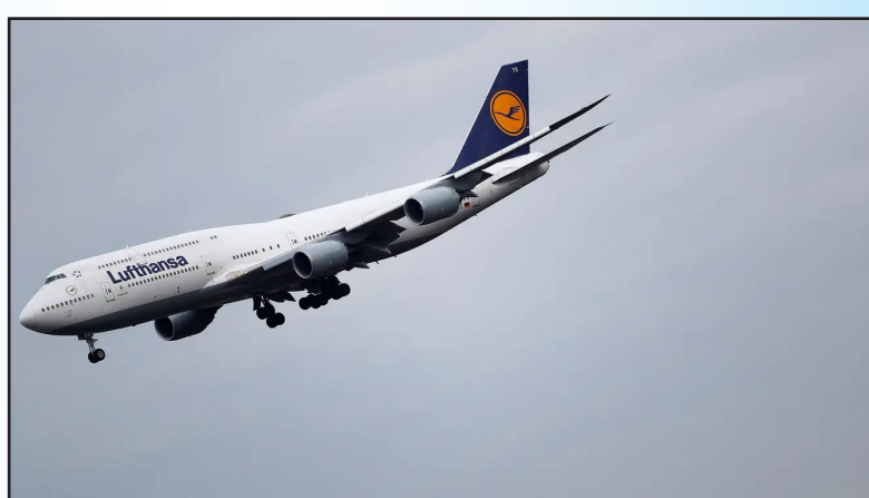
A Lufthansa-operated Boeing 747

The Lufthansa boss said the industry needs two strong providers, referring also to Boeing's European rival Airbus,