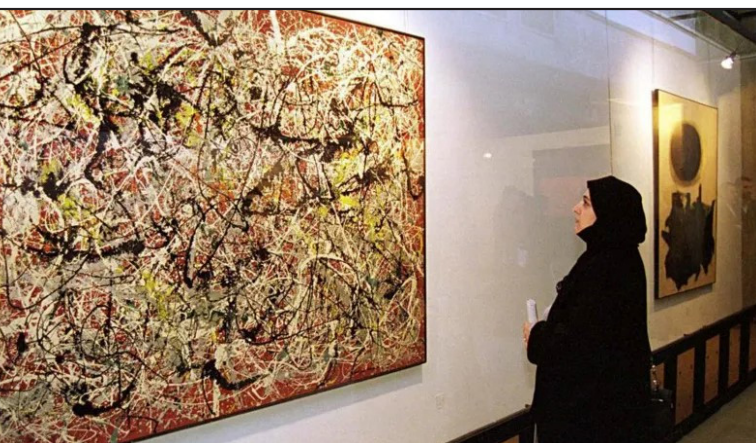
The collection includes Jackson Pollock's Mural on Indian Red Ground.

The Resistance International Film Festival positions itself as a cultural front against global media control, aiming to challenge the narrative imposed by dominant powers and provide a platform for free and independent media to reveal the truth.