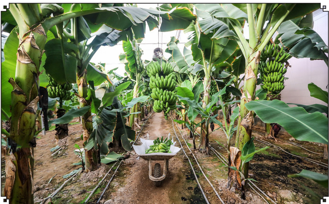
The economic benefits of banana cultivation have prompted some greenhouses in Isfahan province to cultivate the popular fruit.