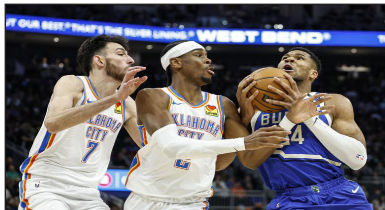
Milwaukee Bucks' Giannis Antetokounmpo, right, drives against Oklahoma City Thunder's Shai Gilgeous-Alexander, center, and Chet Holmgren (7).

The Thunder won 113-107 at Detroit on Saturday, while