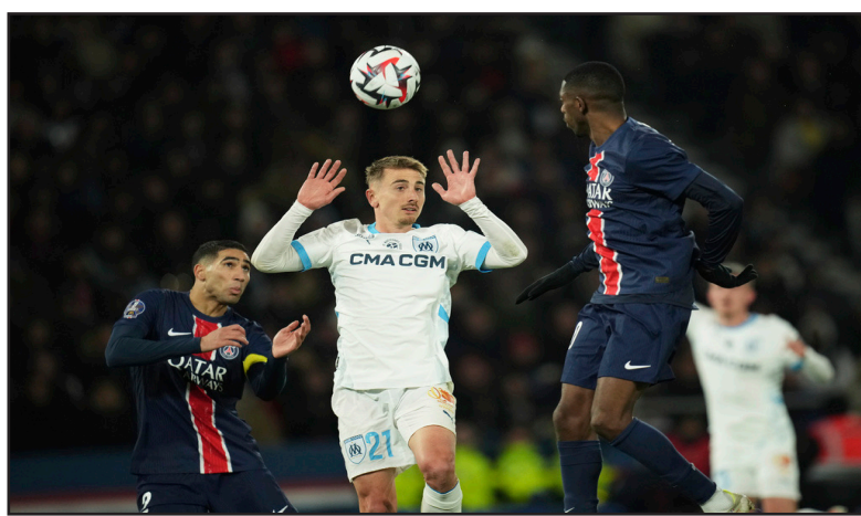
Marseille's Valentin Rongier (center) jumps for the ball with PSG's Ousmane Dembele (right) and PSG's Achraf Hakimi during the French League One soccer match.

Ousmane Dembele broke the deadlock after 17 minutes, racing onto a through ball before slotting home