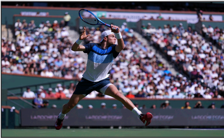
Jack Draper, of Great Britain, returns to Holger Rune, of Denmark, during the final match at the BNP Paribas Open tennis tournament in Indian Wells, California.

INDIAN WELLS (Reuters) - Britain's Jack Draper thrashed Denmark's Holger Rune 6-2 6-2 to collect the biggest title of his career at Indian Wells on Sunday with a place in the top 10 assured for the first time.