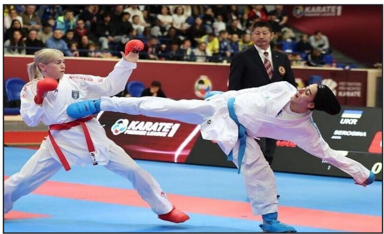
TEHRAN – Iranian athletes grabbed one gold medal, two silvers, and two bronzes at the 2025 Karate 1-Premier League in Hangzhou. Team Melli finished third

in the competition, trailing behind Japan and Egypt, according to Tehran Times.