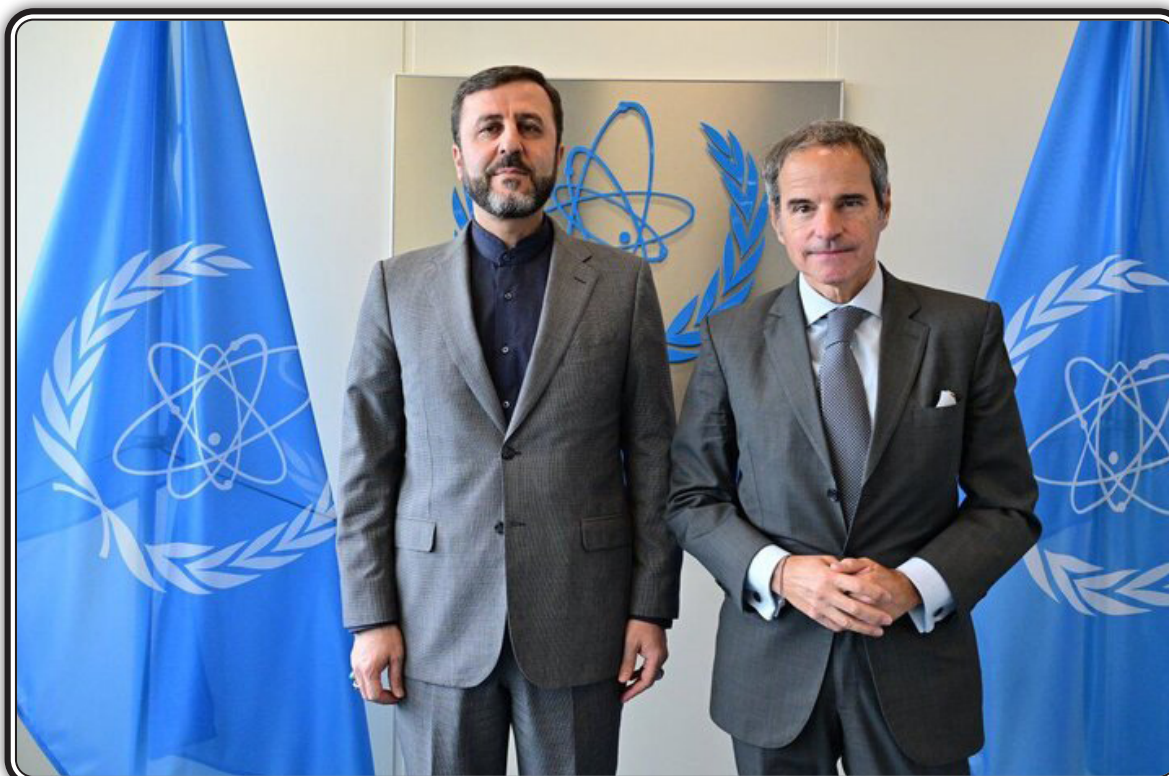
Iran's Deputy Foreign Minister for Legal and International Affairs Kazem Gharibabadi (L) and the Director General of the International Atomic Energy Agency Rafael Grossi.

TEHRAN – Iran's Deputy Foreign Minister for Legal and International Affairs said he had held frank and constructive talks with the Director General of the International Atomic Energy Agency Rafael Grossi in Vienna on Monday.