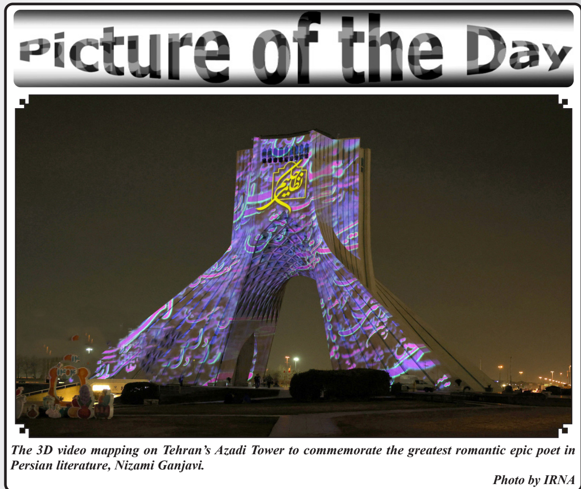
The 3D video mapping on Tehran's Azadi Tower to commemorate the greatest romantic epic poet in Persian literature, Nizami Ganjavi.

The exhibition runs through April 20, 2025.