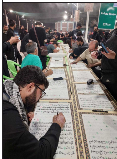
This file photo shows pilgrims writing a copy of the Holy Qur'an on cloth during the Arba'een pilgrimage in Karbala in 2024.

TEHRAN -- A unique handwritten Qur'an, penned by Arba'een pilgrims, is on display at the Abbasid Shrine booth at the 32nd Tehran International Qur'an Exhibition.