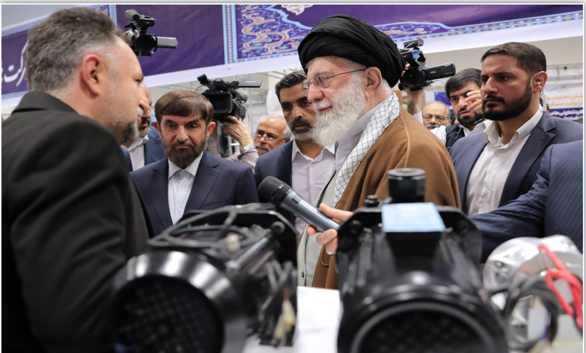
Ayatollah Khamenei listens to a manufacturer at an exhibition showcasing the capabilities and achievements of the private sector in Tehran on Tuesday.