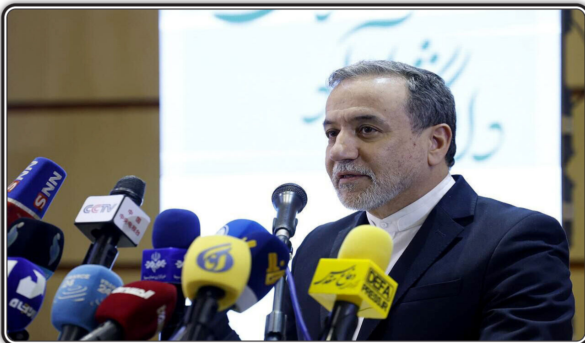
Iran's Foreign Minister Abbas Araghchi addressing a conference of "Al-Aqsa Storm and Gaza" held in Tehran on Tuesday.

TEHRAN - Iran's Foreign Minister Abbas Araghchi says the resistance front has won the war of narratives during the Gaza genocide, as evidenced by the Zionist regime's unprecedented isolation and massive anti-Israel protests across the globe.