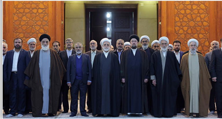
Pictures show Parliament speaker Muhammad Bagher Ghalibaf and Judiciary chief Gholam-Hussein Mohseni-Ejei leading officials on their visits to the mausoleum of Imam Khomeini in southern Tehran Sunday.

TEHRAN – Iran's Parliament speaker Muhammad Bagher Ghalibaf said Sunday the late founder of the Islamic Republic, Imam Khomeini, was the first Muslim thinker to raise awareness about the dangers posed by the Zionist regime.