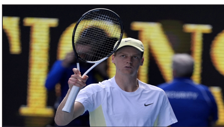
Jannik Sinner of Italy celebrates after defeating Holger Rune of Denmark in their fourth round match at the Australian Open tennis championship in Melbourne, Australia, Monday, Jan. 20, 2025.

LONDON (AP) — Jannik Sinner and Iga Swiatek have won the International Tennis Federation's 2024 world champion awards.