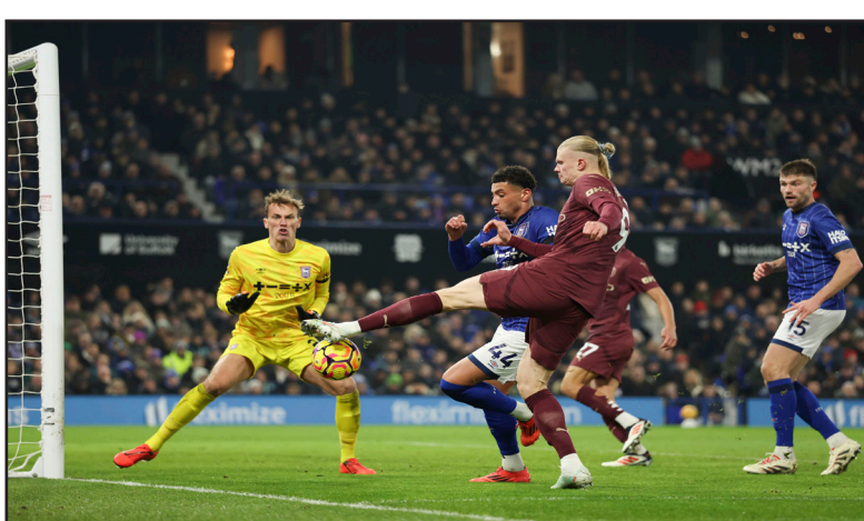
Manchester City's Erling Haaland (front) attempts a shot on goal during the English Premier League soccer match.

Ipswich, who remain 18th on 16 points, had a couple