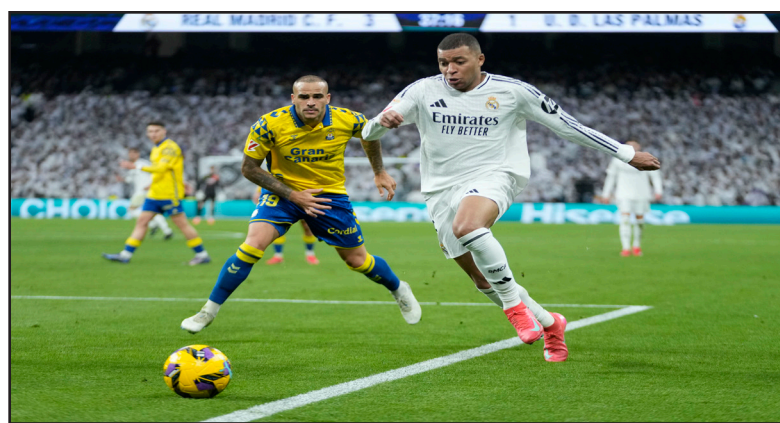
Real Madrid's Kylian Mbappe (right) controls a ball chased by Las Palmas' Sandro Ramirez.

MADRID (AFP) - Kylian Mbappe was in inspired form, scoring twice to guide Real Madrid to a comeback 4-1 win over visitors Las Palmas on Sunday that lifted the champions to the top of the La Liga standings.