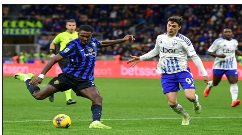
Inter Milan's French forward #09 Marcus Thuram (left) shoots to score Inter Milan's second goal at the San Siro Stadium in Milan on Dec 23, 2024.

Inter finally scored with Augusto's towering far-post header