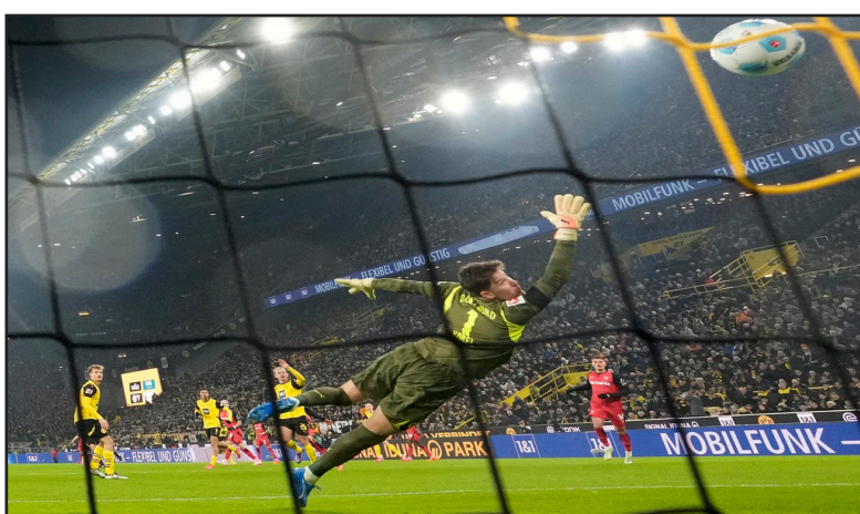
Dortmund's goalkeeper Gregor Kobel dives but fails to save the goal from Leverkusen's Nathan Tella during the German Bundesliga soccer match.

A last-minute backline had to be cobbled together after defenders Waldemar Anton, Emre Can, Ramy Bensebaini and Nico Schlotterbeck were all ruled out along with long-time injured Niklas Sule.