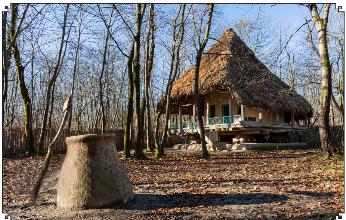
The Gilan Rural Heritage Museum is Iran's only open-air eco-museum built in the forest park of Saravan.