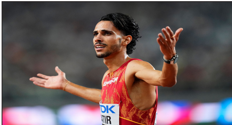
Mohamed Katir of Spain reacts after taking the silver medal in the final of the Men's 5000-meters during the World Athletics Championships in Budapest, Hungary, Aug 27, 2023.

fied travel documents (namely a travel itinerary, boarding pass and booking confirmation) in an attempt to mislead investigators," the AIU said in a statement.