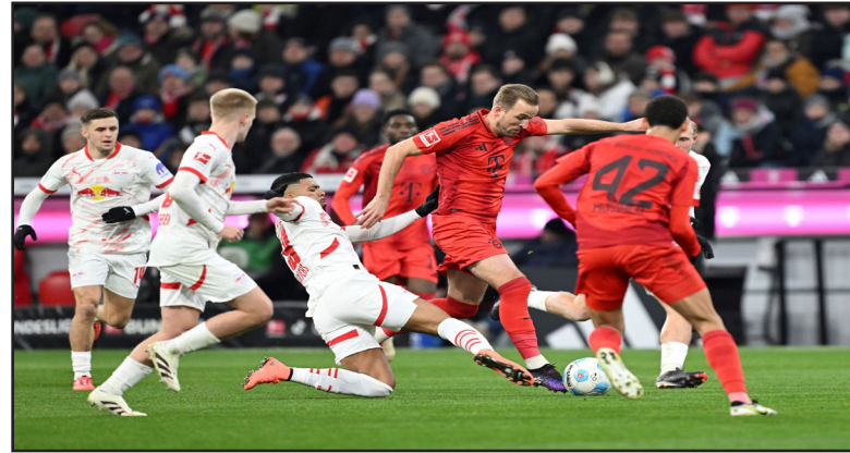
Munich's Harry Kane (center right) vies for the ball against Leipzig's Benjamin Henrichs (center left) at the Allianz Arena, Munich, Germany, Dec 20, 2024.

MUNICH (Reuters) - Bayern Munich have stamped their authority over the Bundesliga in commanding style by hammering fourth-placed RB Leipzig 5-1 in a game that featured two goals in the opening two minutes for the first time in the league's history.