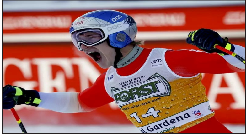
Switzerland's Marco Odermatt roars with delight after his World Cup downhill triumph at Val Gardena.