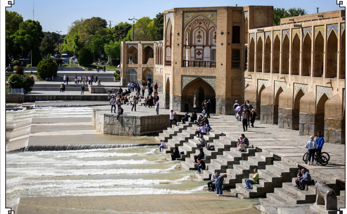
Along the banks of Zayandeh Rud under the iconic Si-o-Se Pol Bridge in Isfahan on Friday, April 19, 2024.